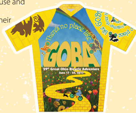
Unisex jersey front