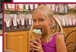
Dietsch's Ice Cream